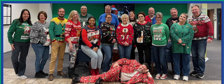
Above: On Tuesday, Dec. 12, Expree staff members filled the day as The Salvation Army bellringers at both entrances for Kroger on the eastside. The volunteers helped raise more than $660. 15 of our 26 employees participated in the day. Below: Staff members participate in Ugly Sweater Day.