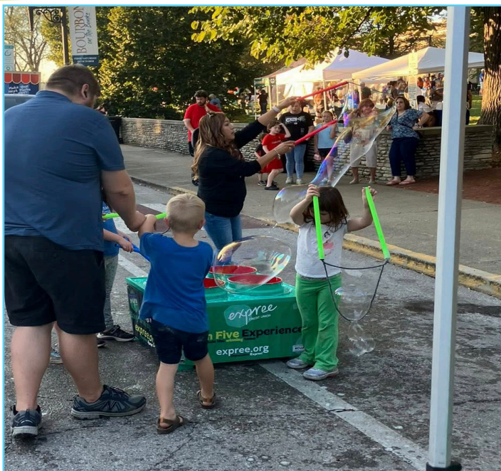
Expree sponsors Bourbon St. on Broadway during the Bourbon on the Banks event. It is a magical evening for the entire family. This year Expree debut a new bubble table for all to enjoy.