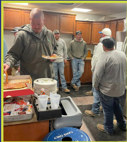
Expree Credit Union provided breakfast for Franklin County Schools district office on March 20, 2023. Lunch was provided for Frankfort Plant Board employees that put in endless hours after the wind storm.