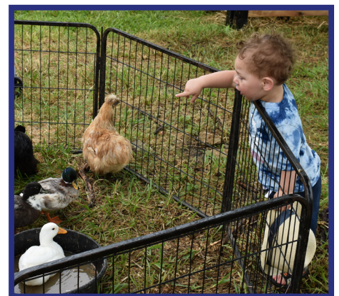
Kids' Adventure Day 2022 brought out little ones to play games, experience the petting zoo and enjoy snacks.