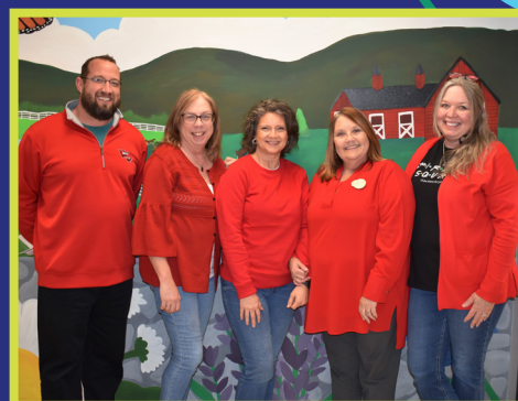
On Feb. 3, 2023, Expree Credit Union employees participated in the American Heart Association Wear Red Day to raise awareness about heart disease.