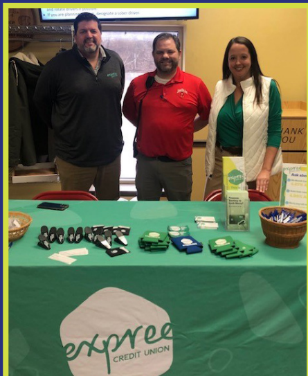
Expree Credit Union participated in wellness and benefits fairs for Department of Public Advocacy and Beam Suntory.